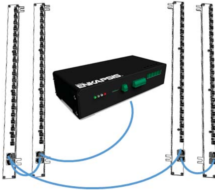
iBCPM-84 Circuit Shown